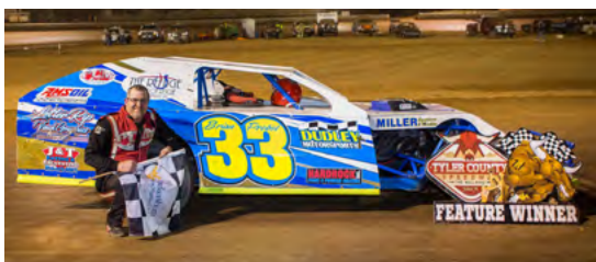
HOT MODS — $1,500