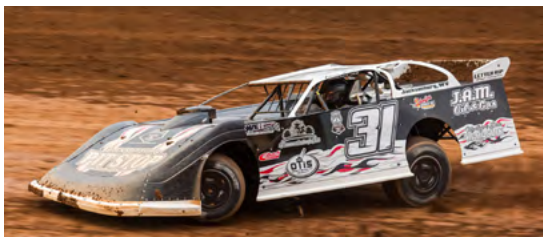
LATE MODELS — $2,500

WE ALREADY HAVE YOUR CUSTOMER MARKET BASE IN OUR WINNERS CIRCLE! JOIN US!