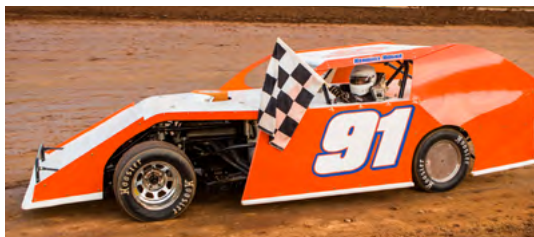
SPORTSMODS — $1,500