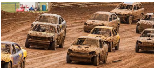
ENDURO SERIES $1,000

Take advantage of the unique and valuable marketing opportunity of becoming a major sponsor of one of Tyler County Speedway's exciting racing divisions for the entire season and get these amazing benefits;