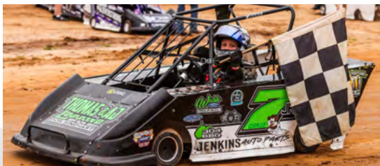
MINI WEDGE — $1,000