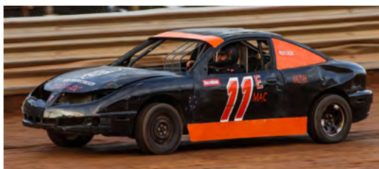
SCRA 4 CYLINDERS — $1,000