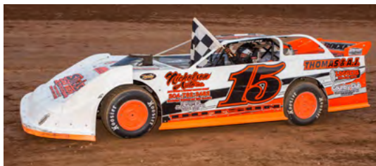
RUSH LATE MODELS — $2,000